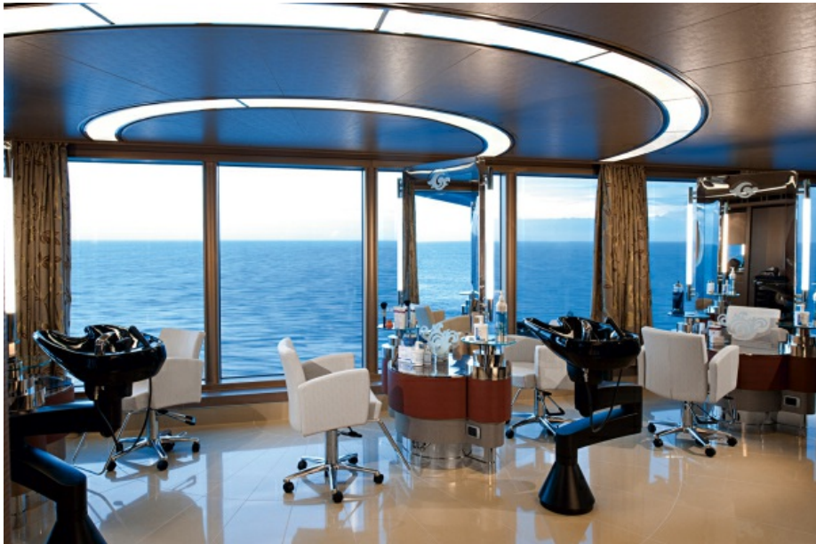
Take in the view of the open ocean while you get a blowout!

All ships have an acupuncturist onboard, stimulating acupoints with needles to alleviate pain, anxiety, arthritis and many other conditions.