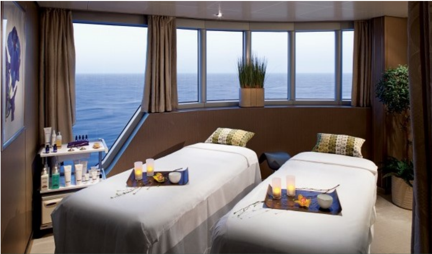
Take your relaxation to a new level at The Greenhouse Spa and Salon.

With the array of culinary options, exciting activities, spectacular shows and entertainment at your fingertips, it can be relatively easy to forget to relax on your cruise.