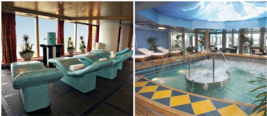
Heated loungers in the Thermal Suite and the hydromassage pool make up the Greenhouse Retreat.

The best way to rejuvenate your mind, body and soul is to pay a visit to the shipboard Greenhouse Spa & Salon, arguably among the finest spas at sea.